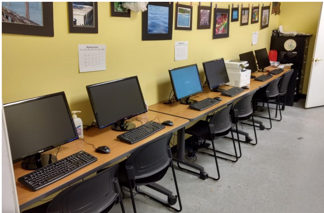
The upgraded computer lab at Journeys and Discovery funded by the OceanFirst Foundation includes ten new workstations, ten iPads, and a new printer for participants to utilize for career exploration.